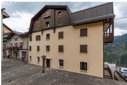
?? Center of Pieve di Livinallongo

Its central position, close to all main services, combined with the convenience of reaching ski lifts and hiking trails within minutes, makes this property a unique opportunity both for personal use and as a high-yield tourist investment.